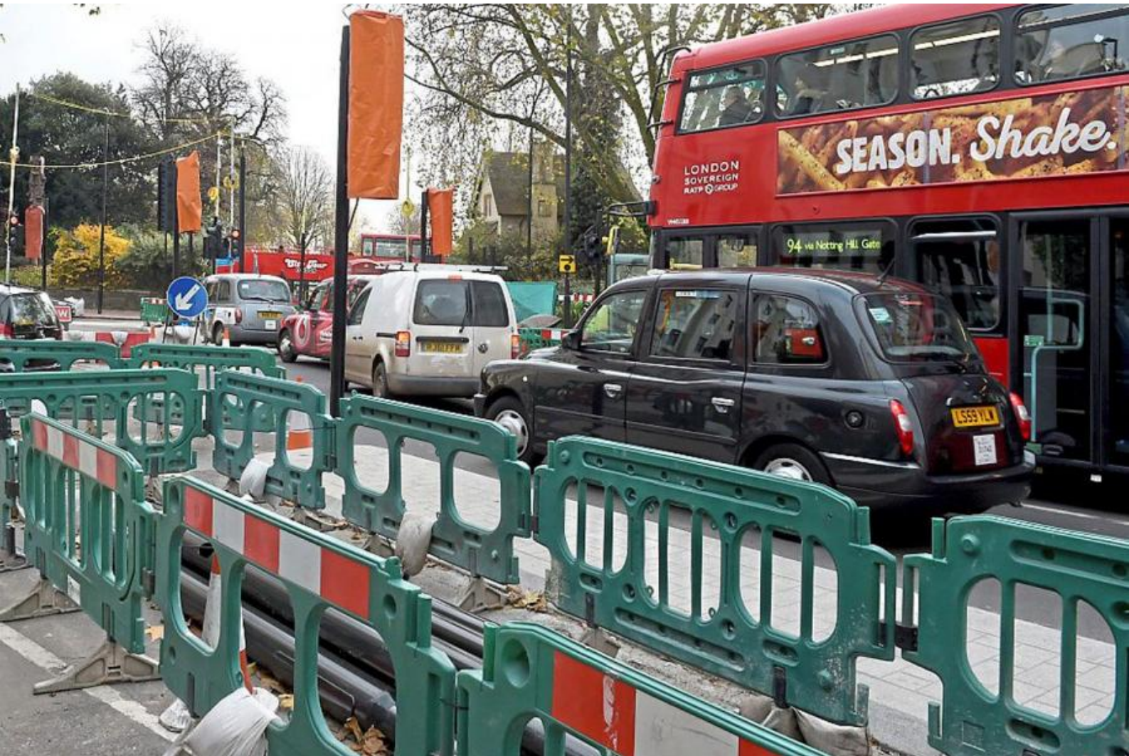
Construction work and dwindling road space are causing the traffic in London to grind to a halt Jeremy Selwyn